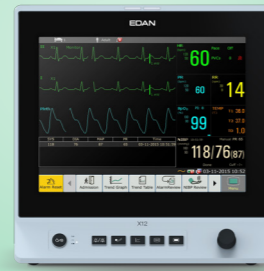
X series Patient Monitor